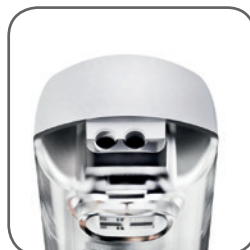
Cage Clamp or Wieland connection